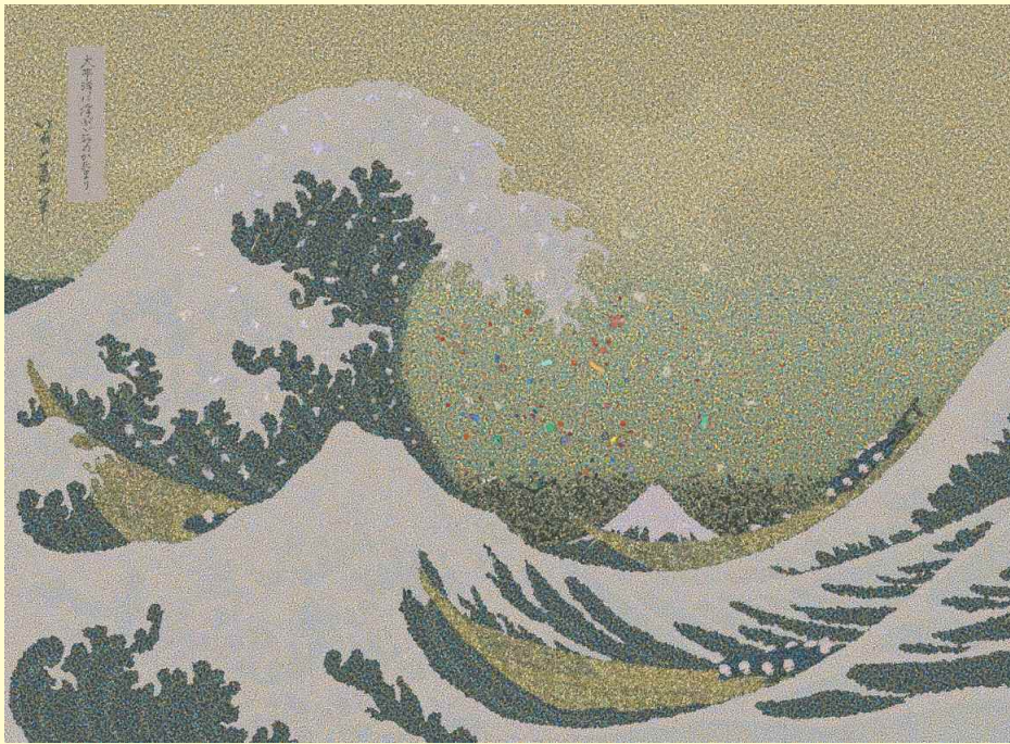
The entire image, consisting of 2.4 million pieces of plastic.